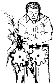
Figure 1. Hand may travel 3.6 feet before grip can be released.

Cornpickers are usually involved in most severe corn harvesting accidents, mainly because of their easily clogged gathering mechanisms. Characteristically, cornpicking accidents occur when the snapping rolls become plugged and the operator tries to remove debris or cornstalks while the machine is still running. As the operator tugs at a plugged stalk or weed, the snapping rolls may suddenly free up and begin to roll, yanking stalks or weeds forward at nearly 12 feet per second. Before the operator can release his grip, his hand and arm have traveled about three and a half feet into the machine (figure 1). To make matters worse, once the person is entangled in the machine, it is often a very difficult and time consuming task to get the victim out.